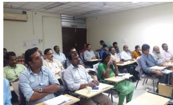
Officials attending the convergence meeting

SFURTI Scheme. In the presentation, he explained about the various components of the SFURTI scheme and progress made under the scheme.