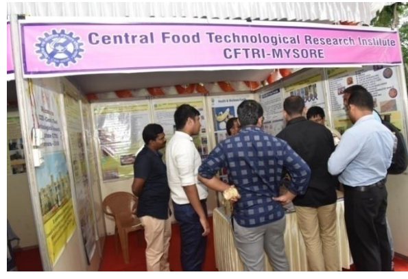
View from the Exhibition