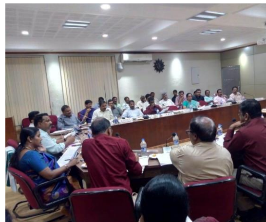
Deliverance by the members

chairman desired that in order to achieve the target envisaged under Stand Up India Scheme, DICs and Dept. of SC/ST may be involved in referring cases for loan under the scheme. The forum also discussed about the Cashew Industry in Kerala, which is operating under multiple constraints such as lack of working capital, scarcity of raw material, high raw material costs, high cost of processing rate in Kerala, high proportion of wages to total costs and highly competitive industry.