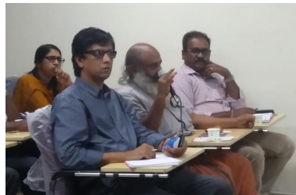
From the interaction Session