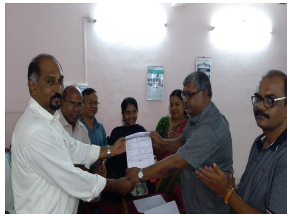
From various UAM Registration Drives