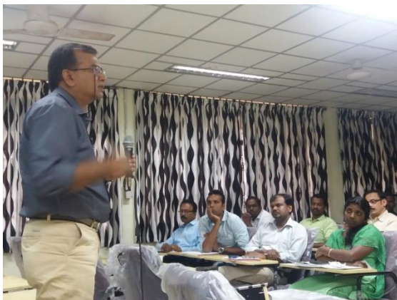
Director, KFRI Peechi explaining about Bamboo